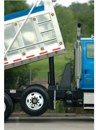
Direct mount, front lift telescopic hoist shown.