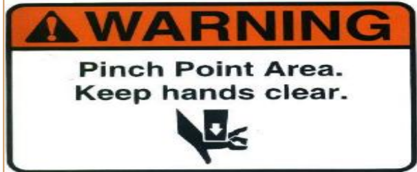
Warning Label for High Lift Tailgate Operations