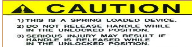
Warning Label For Operation of a Semi-Automatic Tarp System