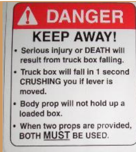
Warning Label For a Dump Body Safety Prop