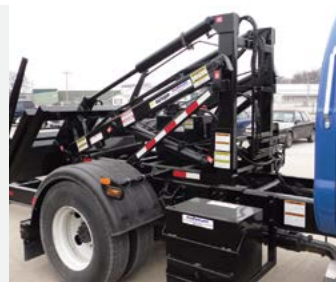
Extra CA can be added for storing lids, welders, toolbox, etc.