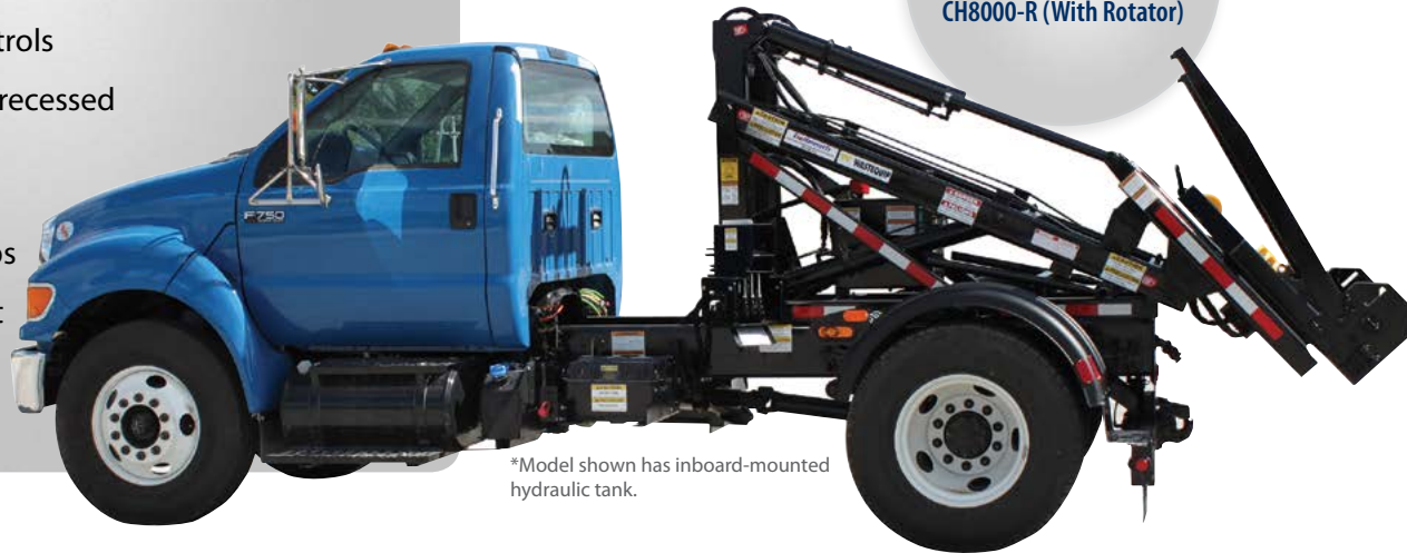
*Model shown has inboard-mounted hydraulic tank.

Available Models: CH8000 (No Rotator) CH8000-R (With Rotator)