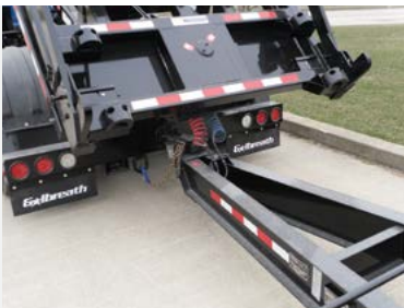
Pintle-ready apron or reese hitch options available