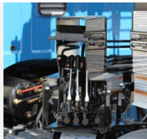
Outside controls with safety cover