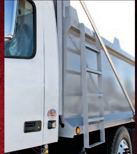
Exterior ladder/interior rungs front driver's side.