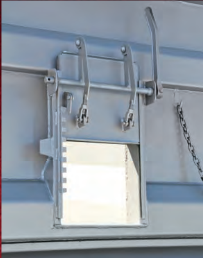
Optional tailgate coal chute (maximum of three).

For demolition, riprap, asphalt, salt, sand-to-large aggregates, spreading materials, on and off road applications