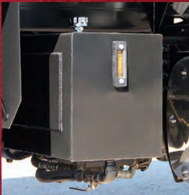
Optional side mounted hydraulic tank with site glass.