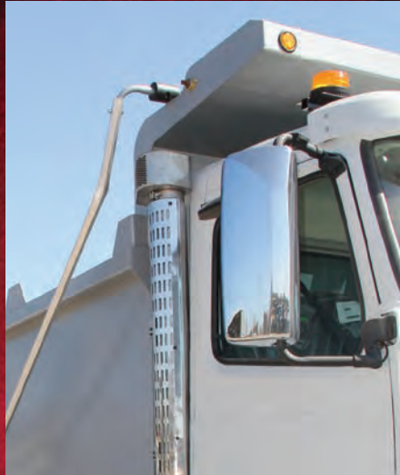
Optional 12" to 42" cab shields (fixed on bolt on).