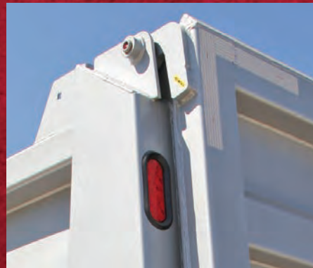
Recessed and rubber grommeted LED lighting to meet FMVSS 108.