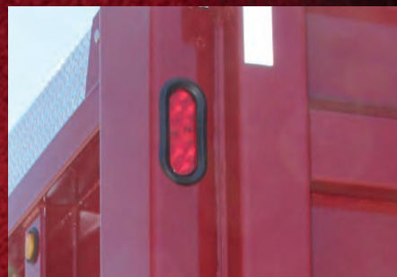
Recessed and rubber grommeted LED lighting.