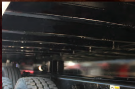
Cross-members, 1.5" x 3" rectangular tubing on 12" centers.