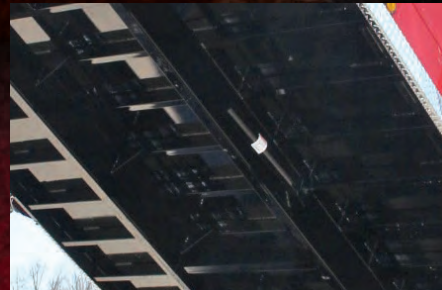
2" x 8" x 3/16" rectangular tubing long sill.