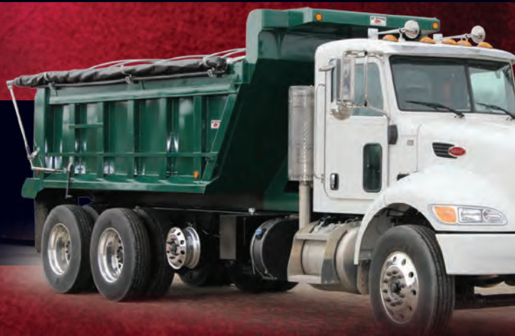
Optional Horizontal Side Rib & Sloped Tailgate