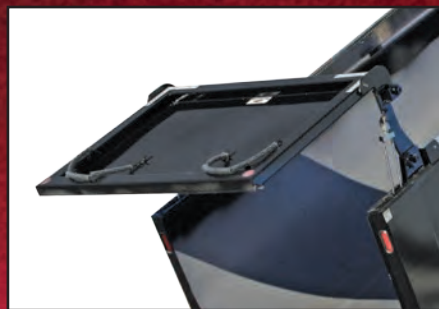
High lift tailgate.