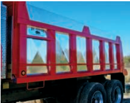
Body Insulation Packages