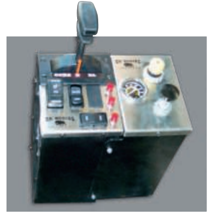
Cab Control Tower accommodates additional accessories