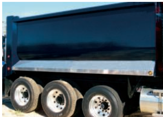
Treadbrite Aluminum Side Skirts