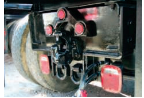
Pintle Hitches 8 Ton Combo up to 50 Ton Rigid

For more information on the complete line of top quality truck body accessories, contact your Ox Bodies representative today!