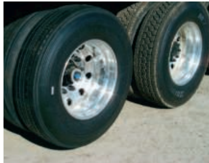
Aluminum Wheel & Tire Package Steel Wheel Also Available