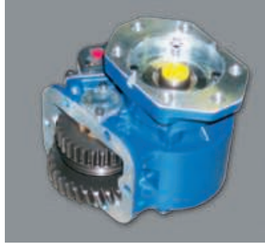
PTO Manual or Hot Shift