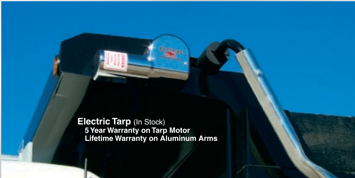
Electric Tarp (In Stock) 5 Year Warranty on Tarp Motor Lifetime Warranty on Aluminum Arms