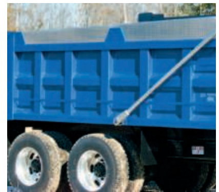
Treadbrite Aluminum Side Boards