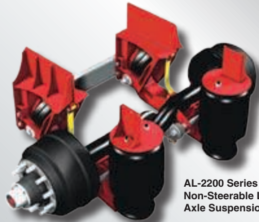
AL-2200 Series Non-Steerable Lift Axle Suspension